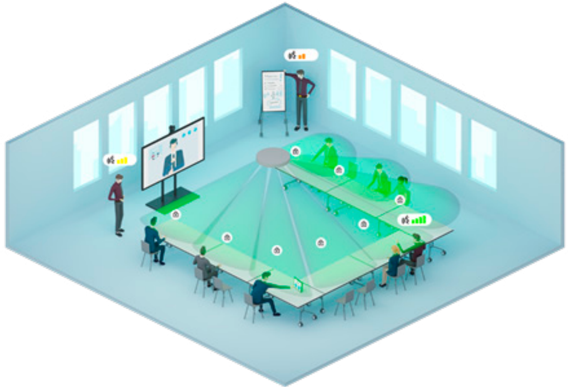
Audibility for different speaking positions in the meeting room inside and outside the preconfigured zones (green = good audibility, orange = reduced audibility)

Since in defined speaking zones there is no dynamic, automatic alignment of the microphone beam to the person speaking, audibility decreases as soon as the speaker leaves their pre-configured zone. This restricts speakers' freedom if, for example, they want to leave their seat at the table to write something on the whiteboard.