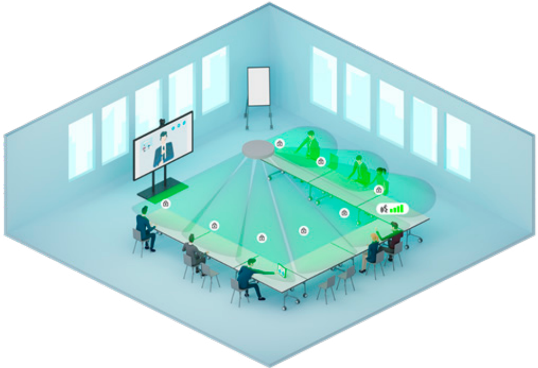
Ceiling microphone with multiple beamforming zones

Ceiling microphone arrays with multiple beamforming zones use pre-configured, static and separate recording areas . The width and directivity of the beams must be pre-defined and fixed. These settings can be saved as pre-sets in the configuration software. For the initial alignment of the individual zones, a set-up mode is usually used. For this purpose, test speech is spoken in the designated zones and the beams are aligned accordingly. The zones can be aligned even more precisely by means of manual fine tuning, i.e. configuration using a software interface. Speech recognition using the auto mixer allows multiple speaking zones to be activated simultaneously. As a combined signal from the static recording areas, the audio channels are bundled so that in the event of several attendees speaking simultaneously, everything that is said can be reproduced with consistent audio quality and volume.